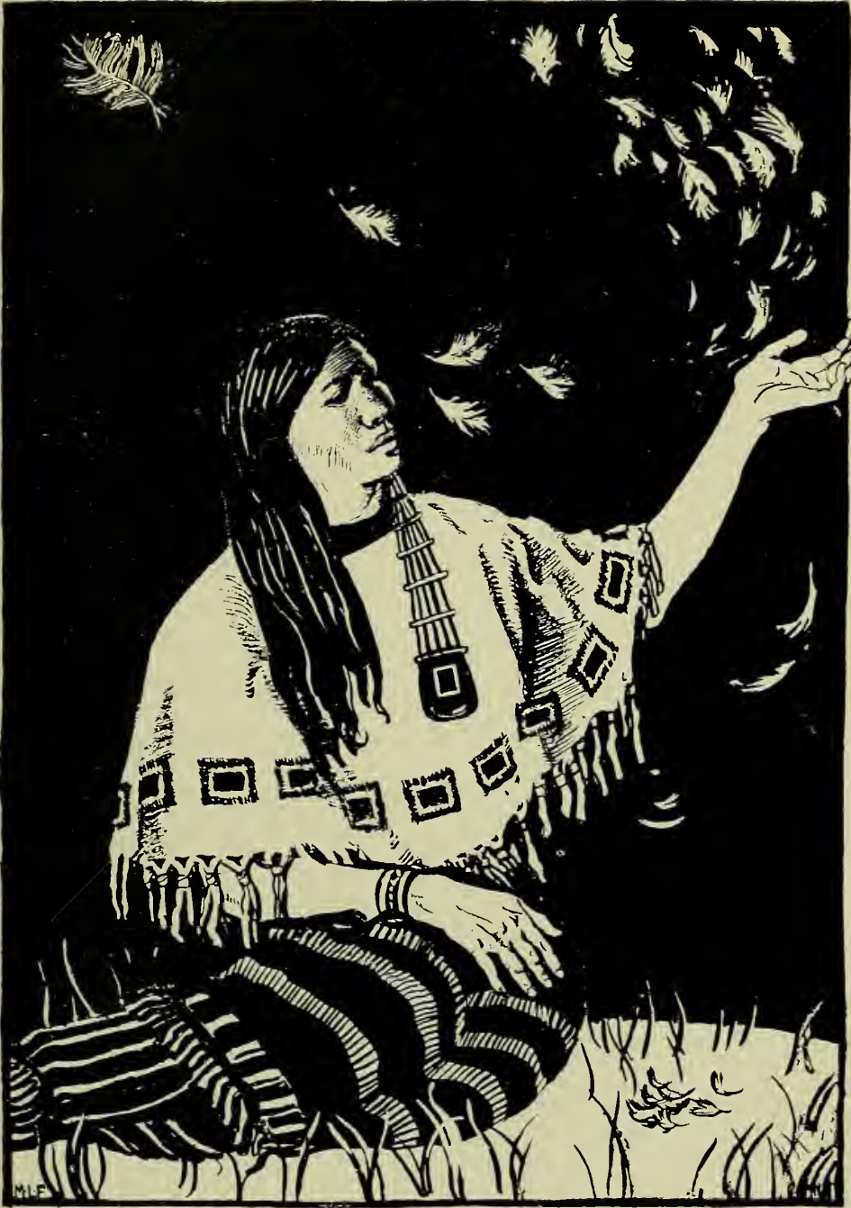
AND SHE MAKES TO HIM AN OFFERING OF TINY WHITE FEATHERS PLUCKED FROM THE BREASTS OF BIRDS